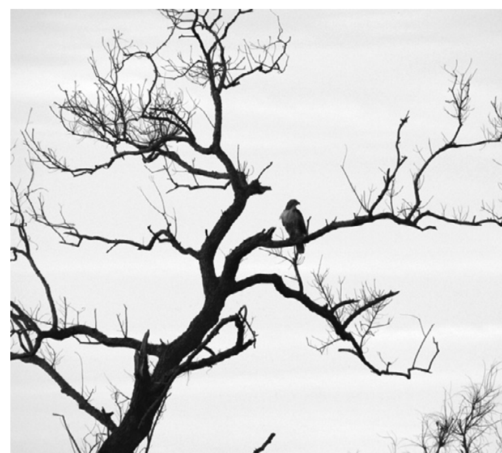
THE MANY hawks wintering in Cameron Parish are finding plenty of dead trees in which to wait for their next meal. With the large number of rats and mice available, they should be well fed.