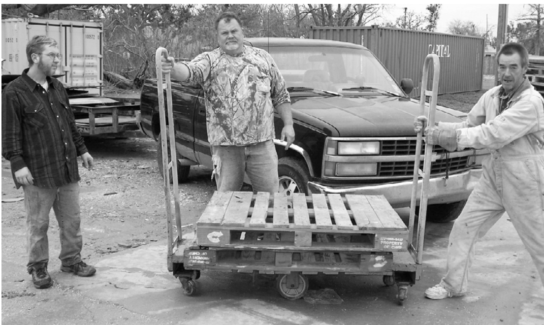
Minvielle Ministries Outreach effort