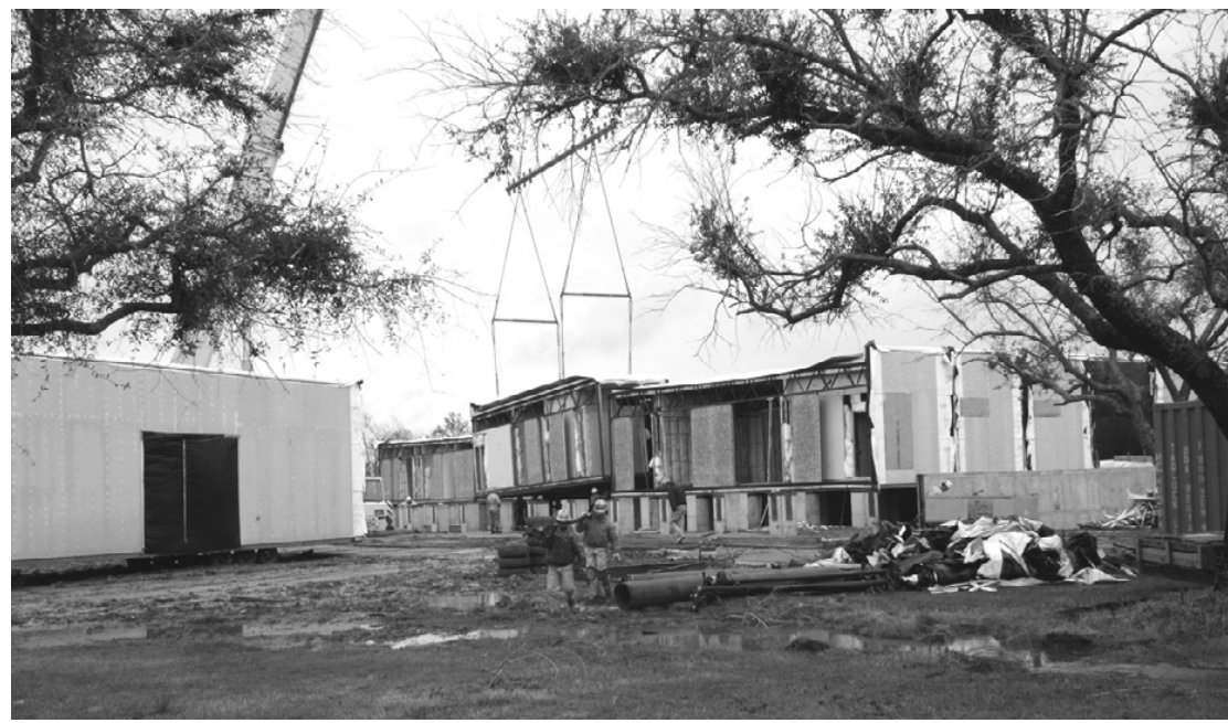
A MODULAR BUILDING section is shown being assembled at South Cameron Memorial Hospital. Over 30 buildings will make up the new hospital. The ER Dept. is slated to open in late March.