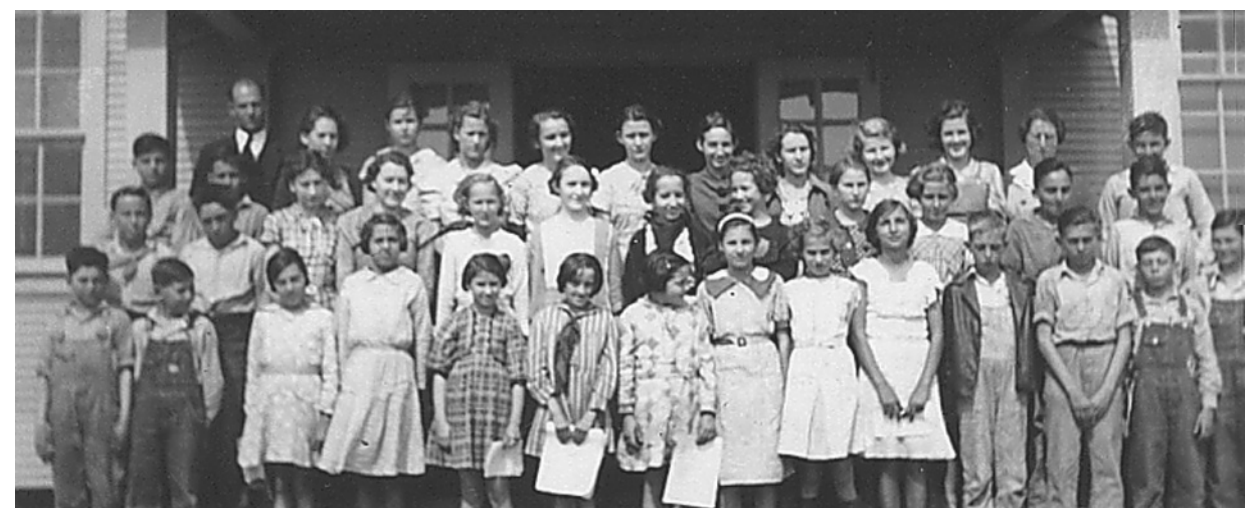
THIS IS A picture of the Grand Chenier 4-H club taken in the 1935-36 school year. All of these "youngsters" would be in their 70s today.

The Louisiana Department of Wildlife and Fisheries will hold a public meeting on the 2002-03 hunting seasons at 7 p.m., Wed., March 20 in the Chalkley Room of the Burton Coliseum in Lake Charles. All interested persons are invited to attend.