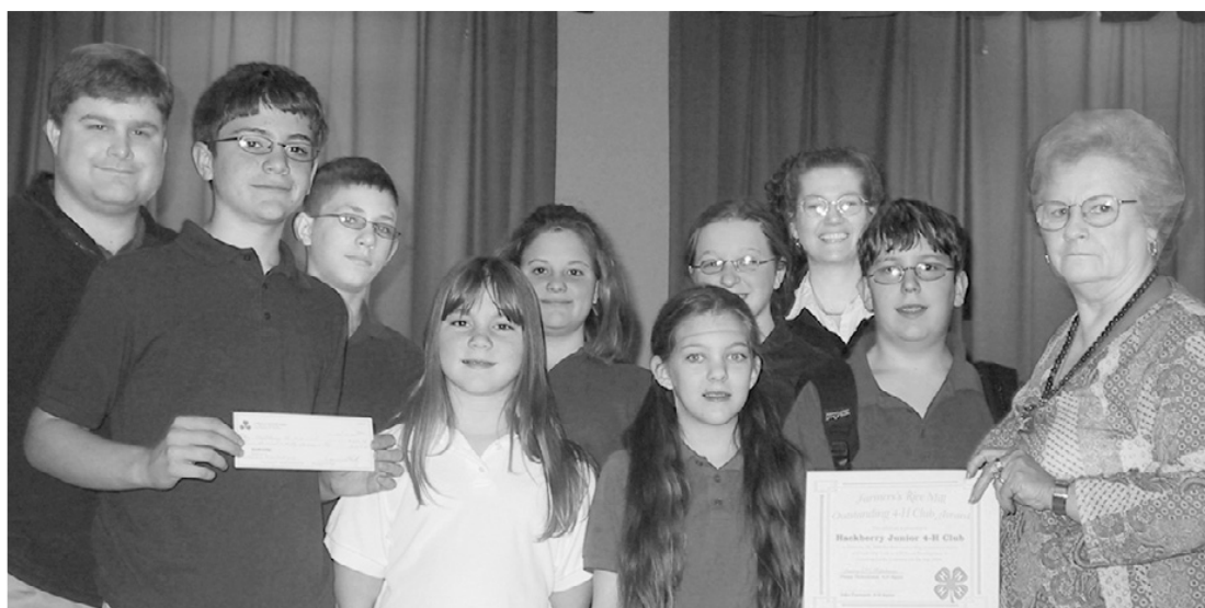
Hackberry Jr. 4-H Club receives Farmers' Rice Mill Award