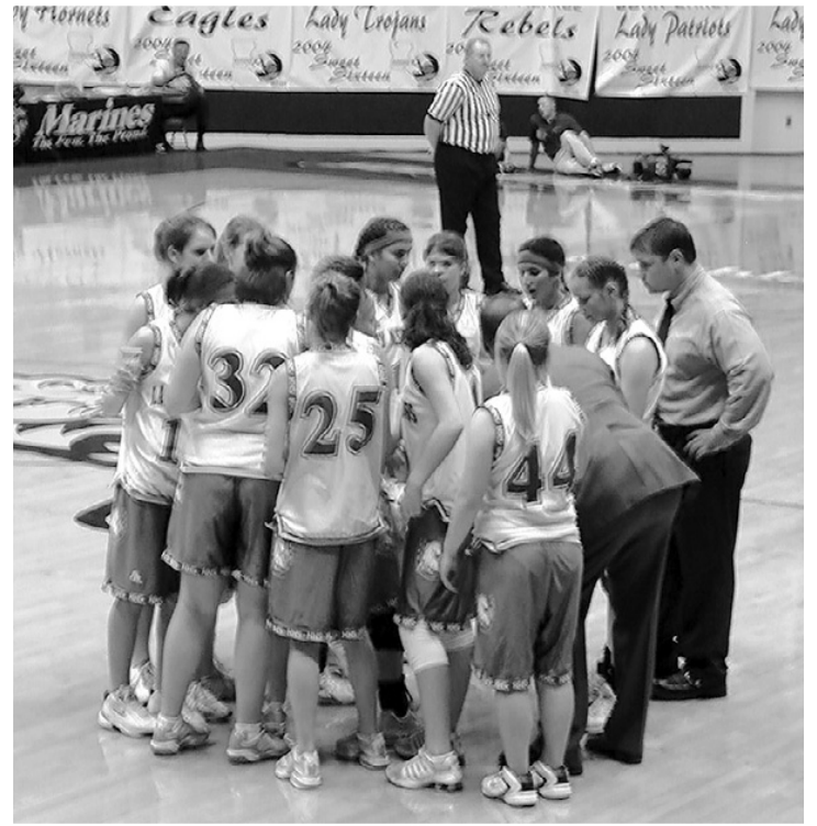
THE HACKBERRY girls basketball team won the state Class C championship last week--their third straight state championship. The Lady Mustangs are shown huddling prior to the start of the championship game in Hammond.