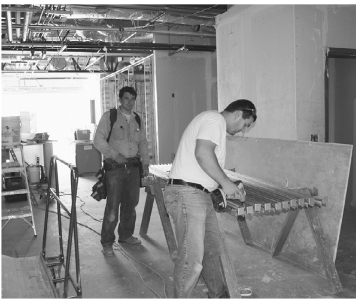
TWO RUMANIAN workers are shown at work on the interior of the new facility for the South Cameron Hospital which was destroyed in Hurricane Rita. There are three languages being spoken on the job -- English, Spanish and Rumanian.