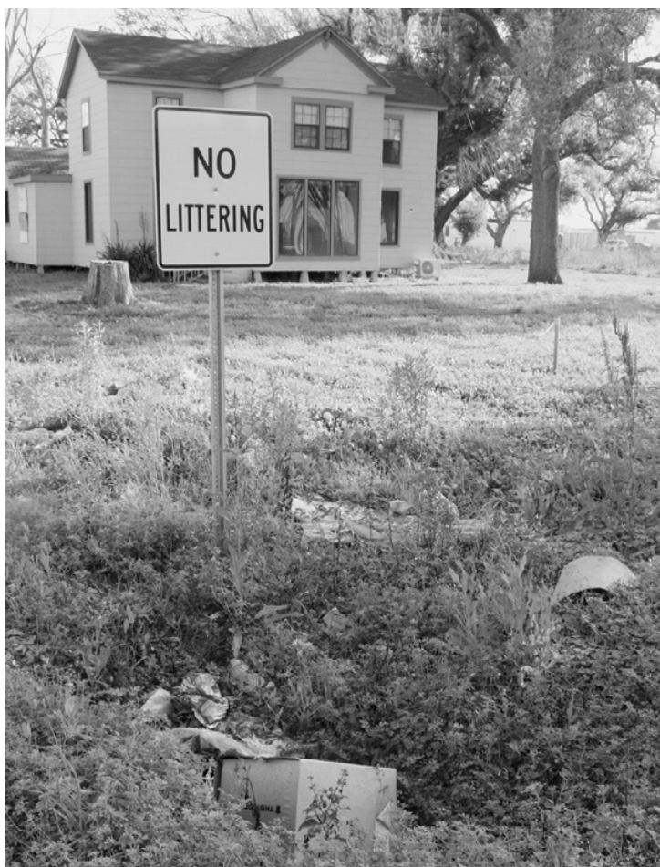
TRASH UNDER the 'No Littering' sign exemplifies a continuing problem in Cameron Parish. Eighteen months after Hurricane Rita, people are still throwing out trash and expecting someone else to pick it up. This photo was taken on the Courthouse Square. The old Nona Welch two story house, which fared relatively well in the storm, can be seen in the background.