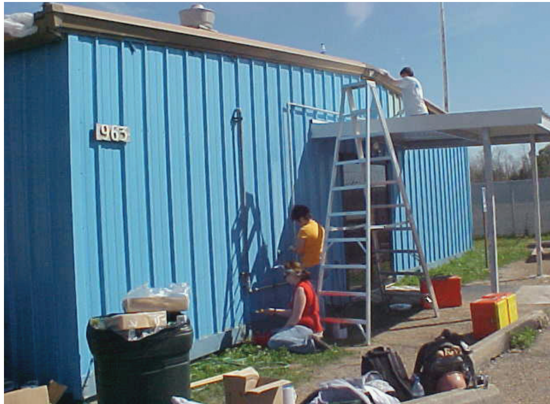
WORK IS CONTINUING on the "old" gym at the South Cameron High School site. Most of the school's buildings were destroyed by Hurricane Rita but have been replaced by temporary buildings. The gym is expected to be usable in time for graduation in May.