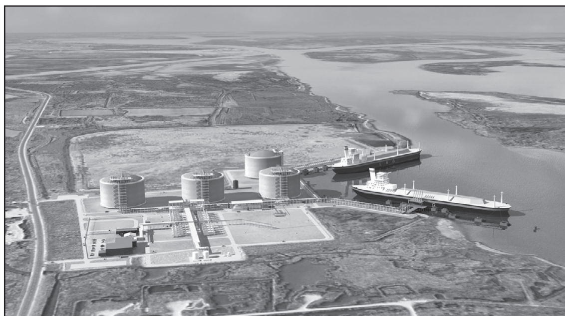
Currently under construction in Hackberry, La., Cameron LNG is anticipated to begin commercial operation in late 2008 and will be capable of delivering 1.5 billion cubic feet (Bcf) per day of natural gas.

12:30 PM - 4:30 PM Calcasieu Workforce Center 4250 Fifth Avenue Lake Charles