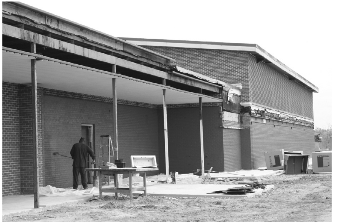
THE OUTSIDE of the gyms at South Cameron High School get a new coat of bright blue paint as part of the renovation of the athletic facility. The roofs have been repaired and electrical systems are being installed as repairs continue in all parts of the building.