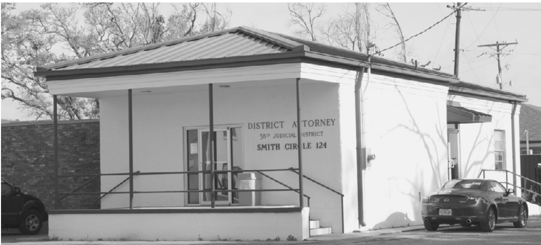
THE CAMERON PARISH District Attorney's office, located behind the courthouse, like the courthouse suffered less damage than most other buildings in lower Cameron during Hurricane Rita. It now has a new look with white paint and a new green roof. The building was originally the voting machines storage warehouse.