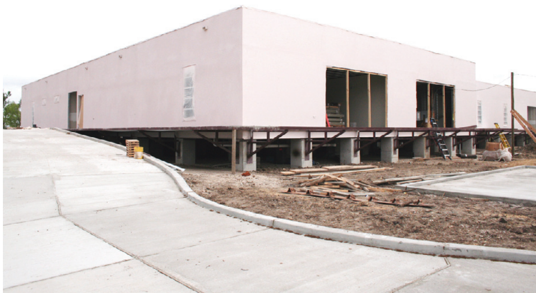
WORK IS CONTINUING on the new facilities for the South Cameron Memorial Hospital which was destroyed in Hurricane Rita in September, 2005.