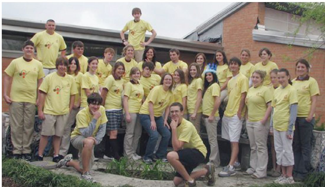
Grand Lake Literary Rally Team