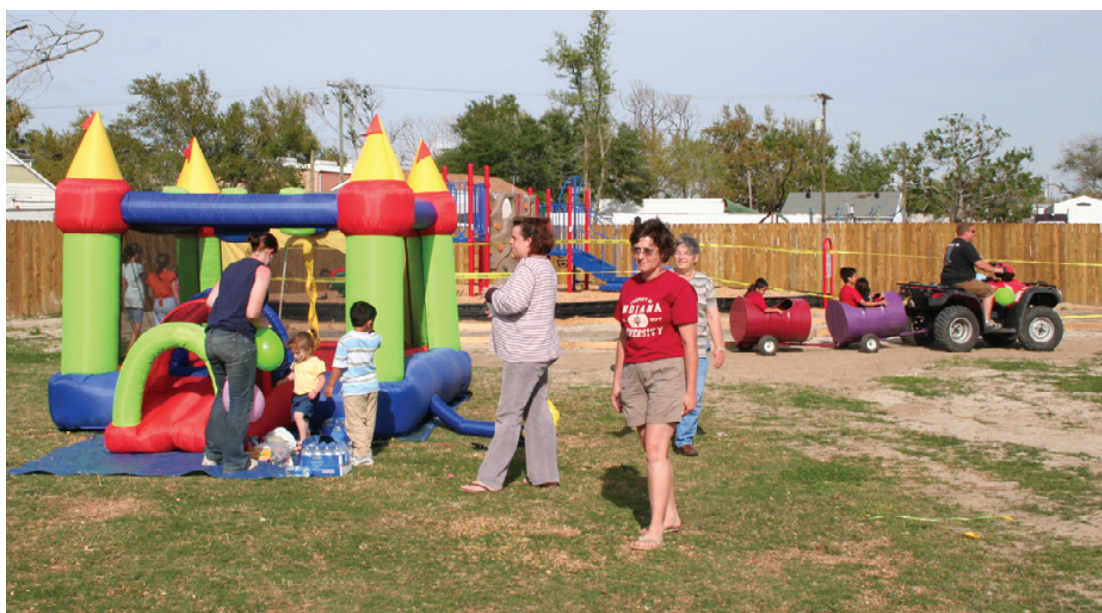
LOCAL CHILDREN had lots of fun at the End of Test Week party held at the Cameron Library, sponsored by the King's Kids youth choir of Valiant, Okla., and the First Baptist Church of Cameron.