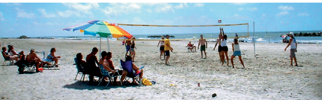
LOTS OF FOLKS enjoyed the sun, sand, and water at the Cajun Riviera Beach Festival last Saturday at Constance Beach.