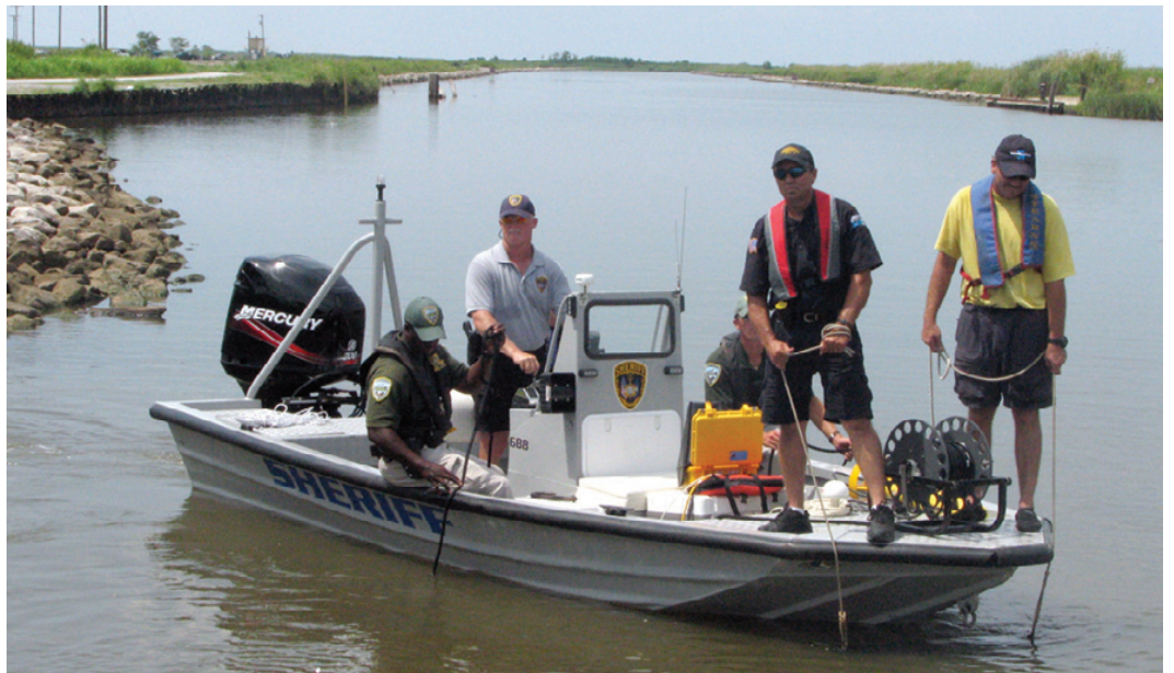
MEMBERS OF the Calcasieu Marine Division and the La. Wildlife and Fisheries assisted the Cameron Parish Sheriff's office in the investigation of the finding of the body of a Texas man on the Rockefeller Refuge on June 18. These were some of the officers who assisted in a diving effort to locate evidence.