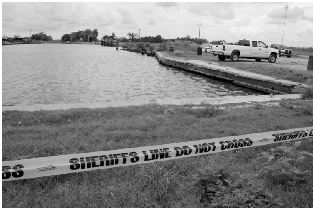
THE BODY OF a Texas man was found at this site, St. Joseph's Harbor on Rockefeller Refuge, on Wednesday, June 18. Since then the waters have been searched for evidence using magnets, sonar, and divers. The site, adjacent to Hwy. 82, remains closed to crabbing and fishing.

Look at the great State of Texas. They have done nothing in nearly three years concerning building codes and I don't blame those great people. Their representatives just don't sell out on Texans. The Cajuns of this great State of Louisiana will have to take the situation in their own hands. Oh yeah, Good