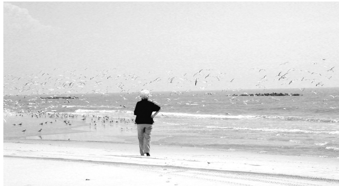
THERE WAS A lone visitor on the beach between Holly and Constance Beaches when this photo was taken recently but there will be thousands there this Fourth of July Weekend which is Cameron Parish's biggest beach event.