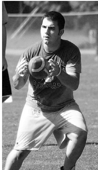
attended the Manning Passing Academy in Hammond.

placed second with a 6.75 pound trout. These fish were caught off the Cameron Jetties in shallow water.