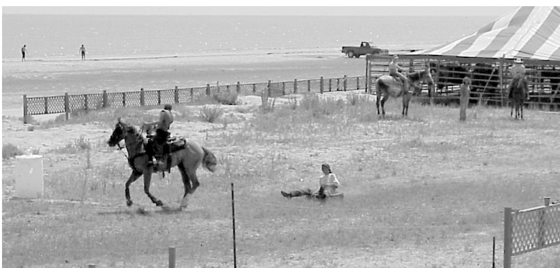
COWBOY GAMES are part of the Rodeo Camp. This one is a relay race involving a pitcher of water. Campers will perform demonstration rides at 9 a.m. Friday.