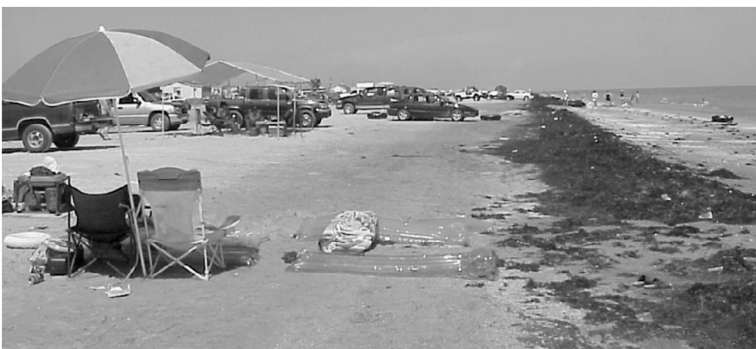
SEAWEED ON THE Beach didn't deter people from setting up and enjoying the Fourth of July at Holly Beach.