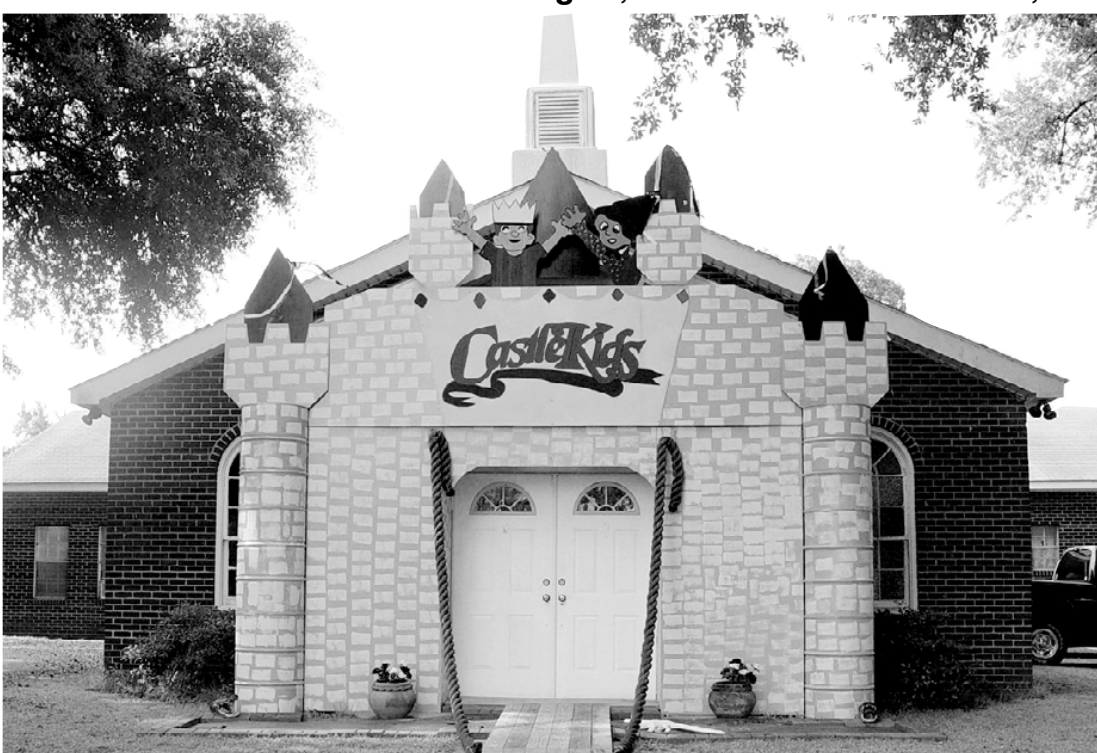
OAK GROVE BAPTIST Church made a castle for their Vacation Bible School this week. The public is invited to see the big castle. The family night program with the children will be held at First United Pentecostal Church, 125 Shannon Lane, Creole, at 6:30 p.m., Friday, July 16, due to space consideration. For more information call the church at 542-4731.