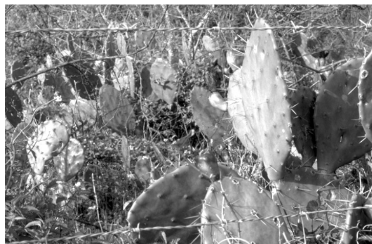
CACTUS IN CAMERON? Although cactus is ordinarily associated with deserts and western states, the plant grows freely in sandy areas of lower Cameron Parish from Johnson Bayou to Grand Chenier. The plant is very colorful when it blooms. Because of its spines, cattle and other animals do not bother it.

All the beautiful sentiments in the world weigh less than a single lovely action. -James Russell Lowell