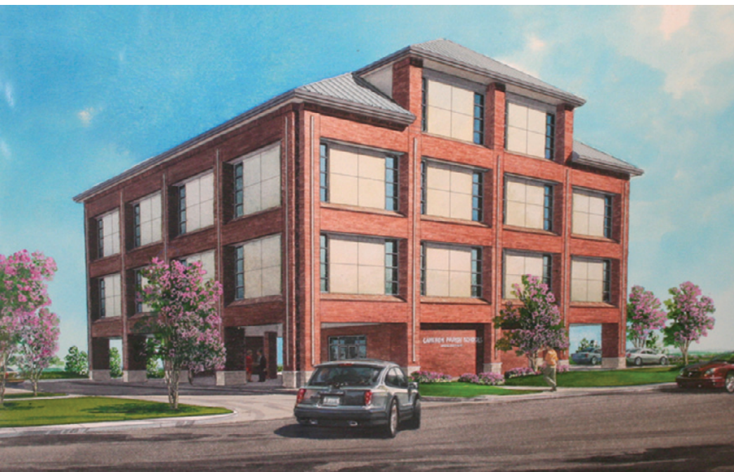
THIS IS A drawing of the proposed Cameron Parish School's Central Office which is to be constructed on the old Cameron Elementary School site. Both buildings were destroyed in Hurricane Rita.