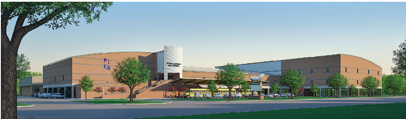
THIS IS AN artist's conception of the new South Cameron High School replacing the old building destroyed in Hurricane Rita. A $24.3 million contract for the construction was awarded by the Cameron Parish School Board Monday.