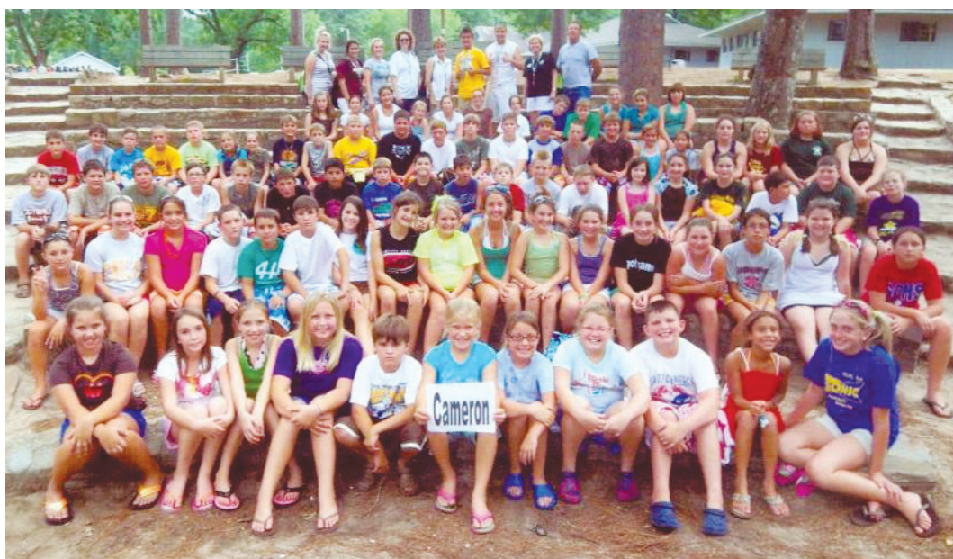
PICTURED ABOVE are the eighty-eight Cameron Parish 4-H club members who attended this year's annual 4-H camp at Grant Walker. Cameron Parish youths learned that going to camp is more than just fun and games. One of the most important skills children learn from camp is self-sufficiency. They learned how to survive four whole days on their own with the guidance of camp staff, their 4-H agents, leaders, and Jr. Counselors. Campers also participated in activities such as canoeing, archery, team building, line dancing, etc.