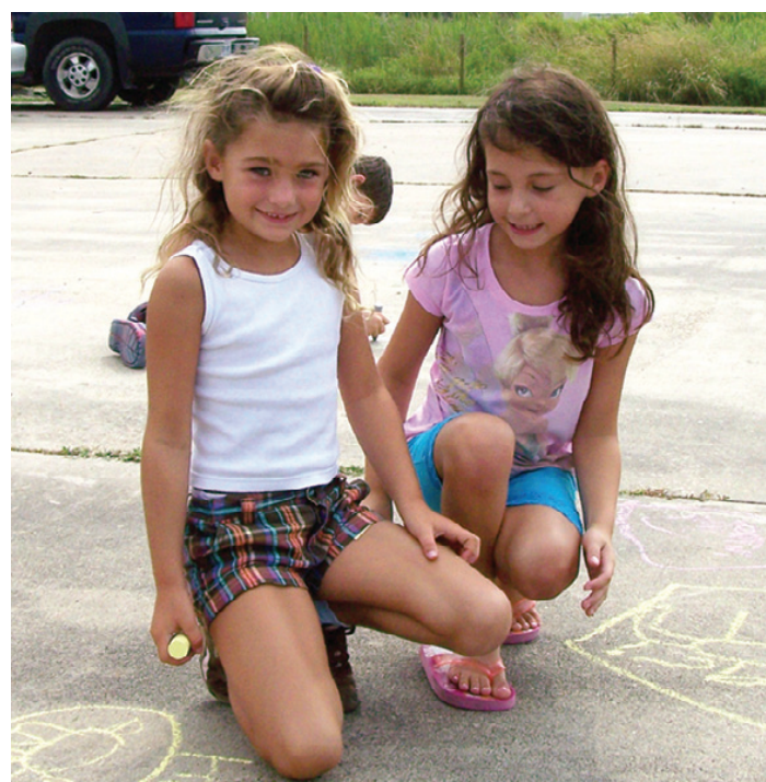
YOUNG PATRONS of the Johnson Bayou Library participate in the branch's "Sidewalk Art and Cookie Walk" festivities on July 2.