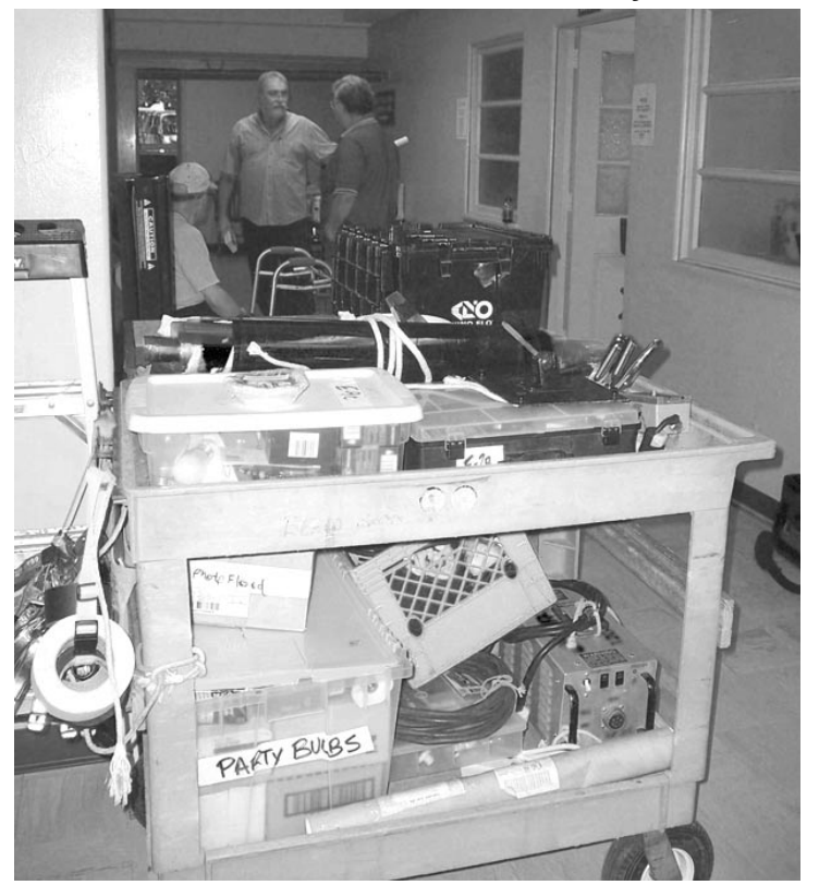
EQUIPMENT LINED the halls as the Little Bayou movie crew prepared to shoot scenes in the basement of the Cameron Court House.

"The community has been unbelievable," he said.