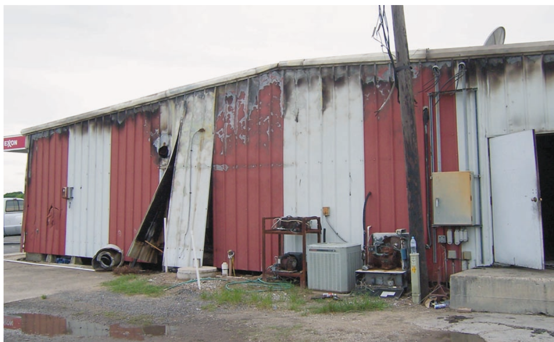
A RECENT FIRE seriously damaged Young's Grocery in Johnson's Bayou. The cause is unknown at this time.

The Cameron NAACP Chapter meeting, which was postponed from last week due to the storm threat, will be held Friday, July 22 at 6:30 p.m. at 183 Lillian St. in Cameron.