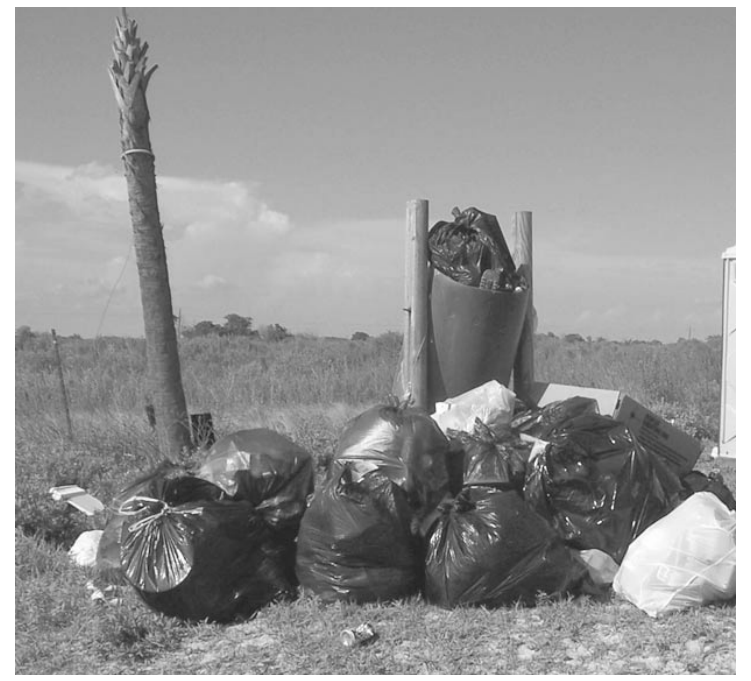
HOLIDAY TRASH really piled up at Rutherford Beach.

So through the foresight of the number one man in the United States the courthouse has continued to meet the needs of the parish, even though it no longer has the distinction of being the smallest parish in Louisiana in population.