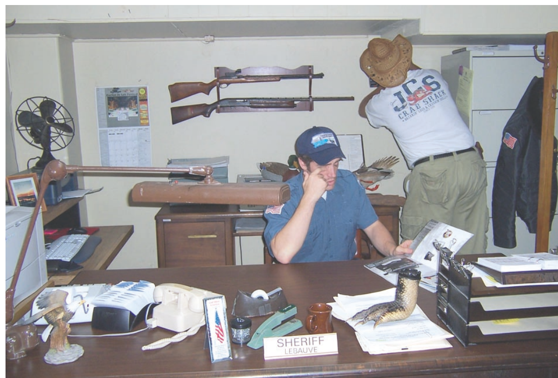
THE CAMERON Court House was turned into a movie set on Wednesday as the cast and crew of "Little Bayou" filmed scenes in the jail and the "Sheriff's Office". A basement office was converted into the headquarters of the fictional Sheriff LaBauve (above).