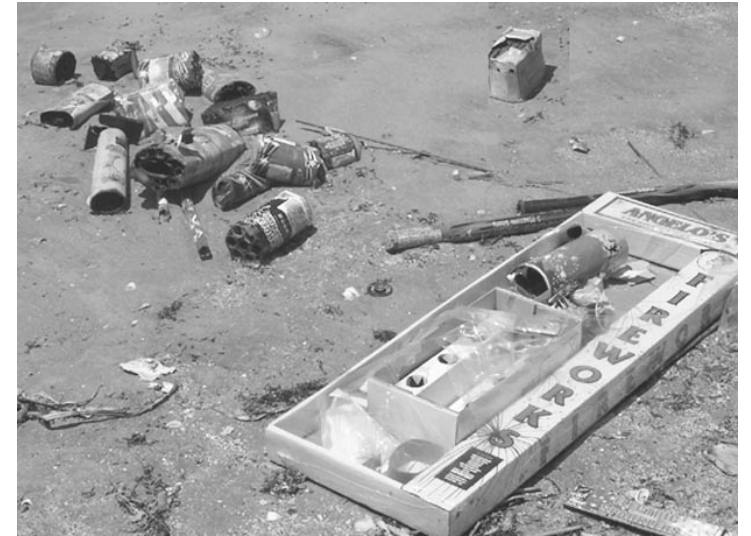
THE AFTERMATH of July 4th fireworks is too often a mess on the beach.