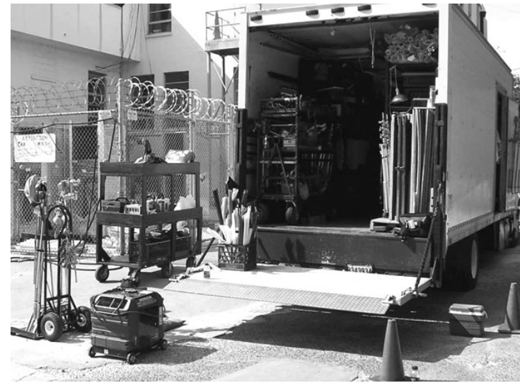
IT TAKES A Lot of equipment to make a movie. The one-way street around the Court House was lined with trucks and scattered with roaming cast and crew members on Wednesday as scenes for the film "Little Bayou" were being shot inside.

Established 67 years ago, JDEC provides service to over 7,000 consumers along 1,584 miles of power line in one of the most hostile geographical environments in Louisiana.