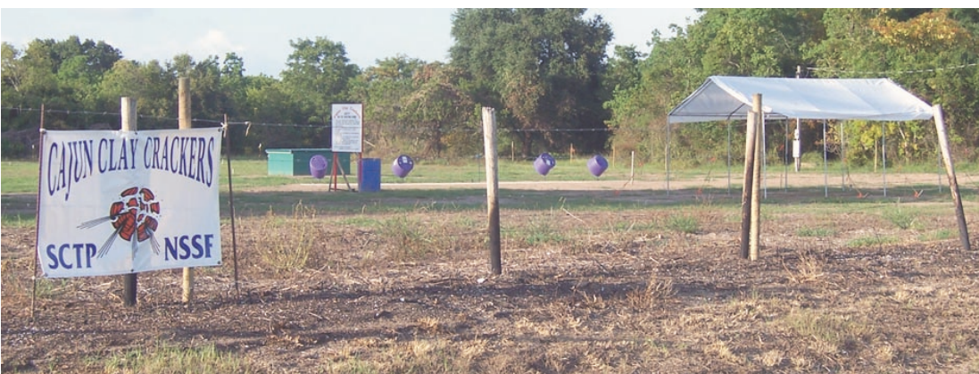
CAJUN CLAY CRACKERS, a youth trapshooting organization, has held its first state match at its new facility in Trosclair Road between Cameron and Oak Grove.