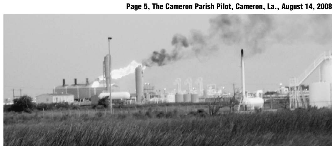
LIGHTNING STRUCK the Crosstex gas plant in Johnson Bayou on Friday, causing a fire in the turbine room. Local firefighters were able to extinguish the fire before it spread to the rest of the facility.