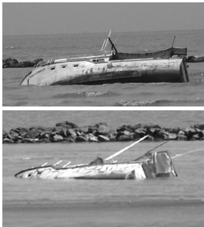
THESE TWO PHOTOS, taken a month apart, show the deterioration of a sunken shrimp boat along Hwy 82 near Holly Beach. The first was on July 4, the second was on August 8. The boat is being buried in the sand behind the breakwater.