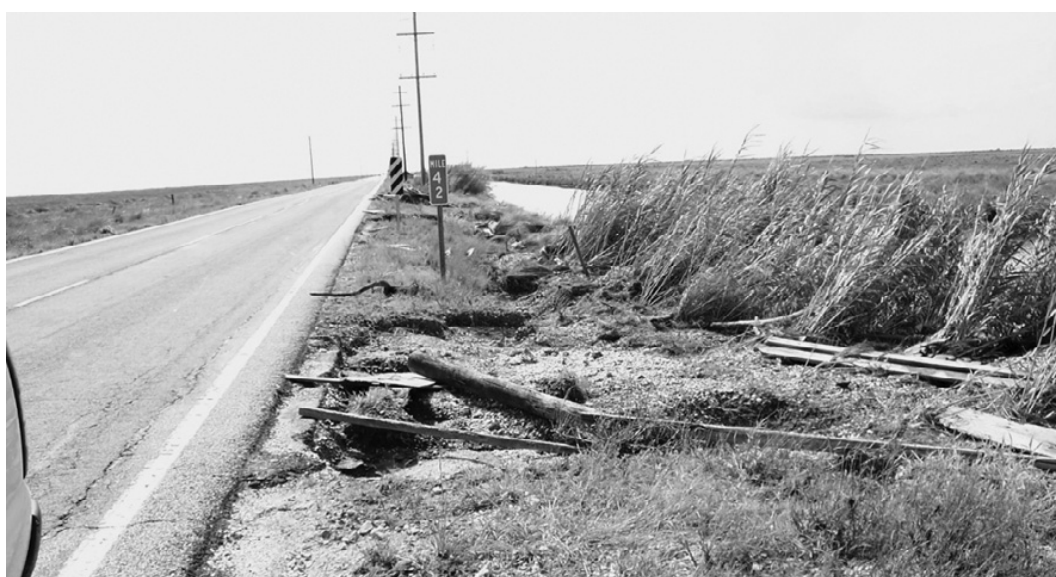
DAMAGE TO THE shoulder of Hwy 27/82 west of the Cameron Ferry caused by storm surge from Tropical Storm Edouard.