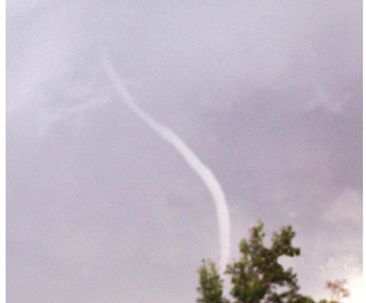
A TORNADO touched down in Johnson Bayou on Friday, Aug. 8 causing damage to Johnson Bayou High School and several cars.