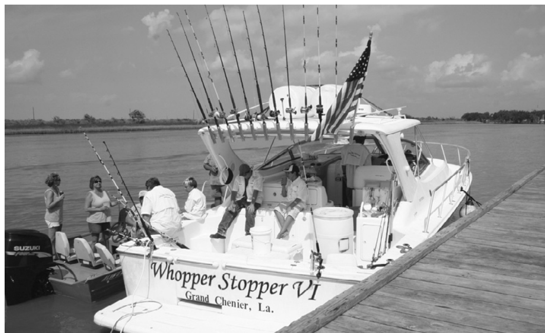
THE CREW OF the "Whopper Stopper VI" of Grand Chenier brought a boatload of deepwater fish in to the dock at Grand Chenier Park for the Cameron Saltwater Fishing Festival.