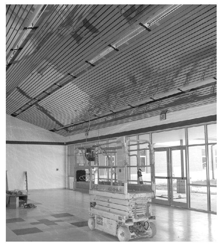
THE NEW LOBBY at Grand Lake Elementary is almost complete. It has a mirrored ceiling. (Photo by Cyndi Sellers.)

SPORTS TROPHIES salvaged from the storm wait for the reconstruction of the gym at South Cameron High School. (Photo by Cyndi Sellers.)