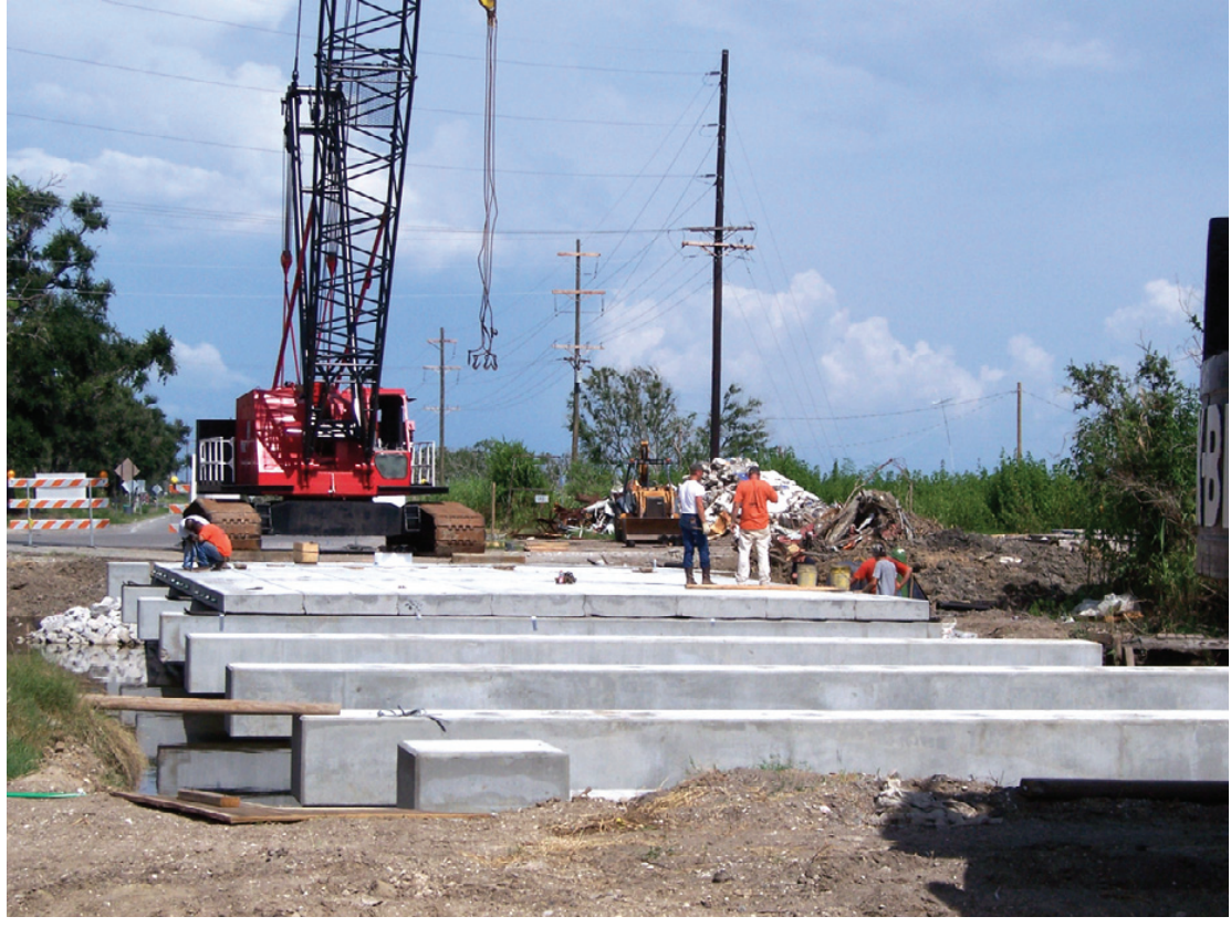
THE OAK GROVE bridge connection Hwy 82 and Trosclair Road is getting closer to completion. But the bridge woes will continue when the Hwy 27 bridge at Creole is

replaced.