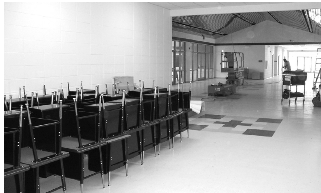
NEW DESKS await delivery to their rooms in the new elementary addition to Grand Lake School.