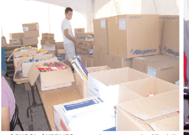
SCHOOL SUPPLIES were given out at the Minvielle Outreach Ministries tent Monday and Tuesday during the