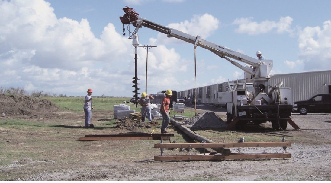
ELECTRIC CREWS are working hard to get power to the South Cameron school site. The modules are in place, and power and plumbing should be finished by Friday.