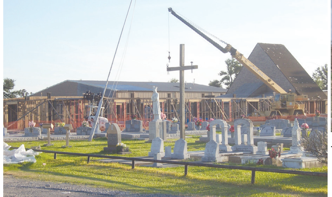
WORK IS PROGRESSING on the rebuilding of St. Peter the Apostle Catholic Church in Hackberry.