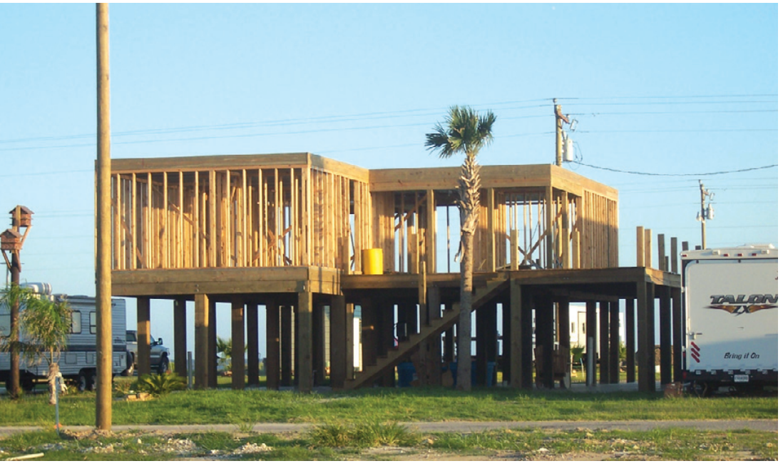
HOLLY BEACH recovery has begun. This is one of the new homes under construction in Holly Beach. It belongs to Doug Boudreaux.