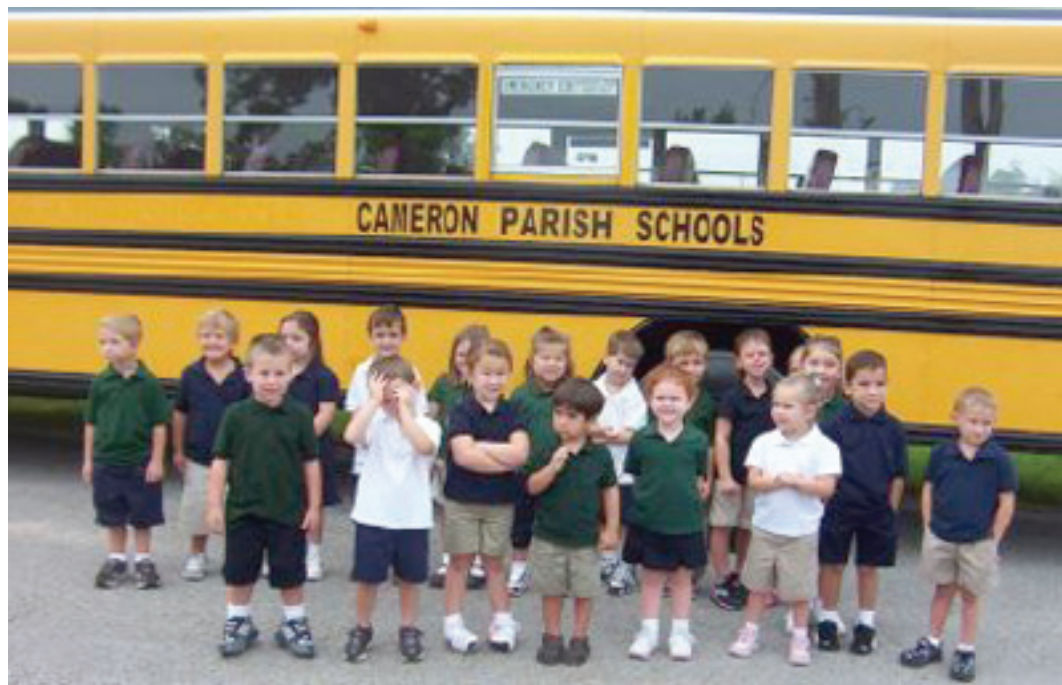
THE KINDERGARTEN, LA4, and preschool classes at Hackberry High School went on a field trip to Stoddard's Alligator Farm Tuesday, Aug. 19. They participated in hatching alligators from their eggs.