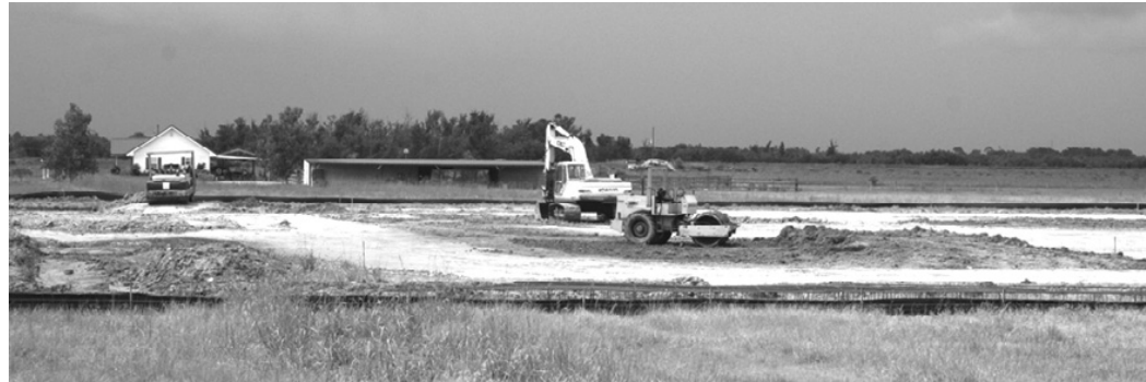
CONSTRUCTION ON the Grand Lake Head Start building has begun, though recent rains have slowed the project. The new Grand Lake Senior Center has also been started next door. Both projects are located on the Gulf Highway and Eighty Acres Road in the northern part of Grand Lake.