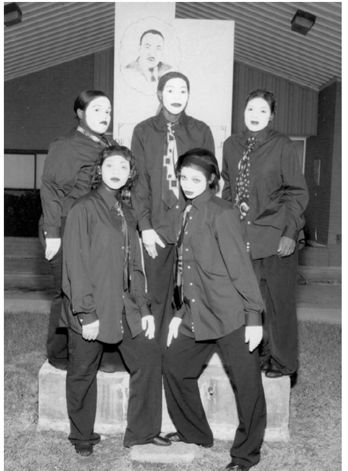
THE MIME MINISTRY group from Sixth Street Baptist Church in Port Arthur will perform at the 30th annual banquet of the Cameron NAACP at 3 p.m., Saturday, Aug. 23 at the Martin Luther King Center, 3008 N. Simmons St., Lake Charles. For information on banquet tickets, call 433-0998 or 853-6283.