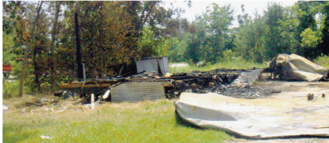
THE HACKBERRY Volunteer Fire Dept responded to a trailer on fire off Hwy. 27 on Wednesday, Aug. 13. Medic 6 also responded. The abandoned trailer had been in the process of being torn down. The trailer was located in a trailer park owned by Perfecto Gallegos. Traffic was rerouted to Old Town Road because the trailer park is located in a curve of the road.