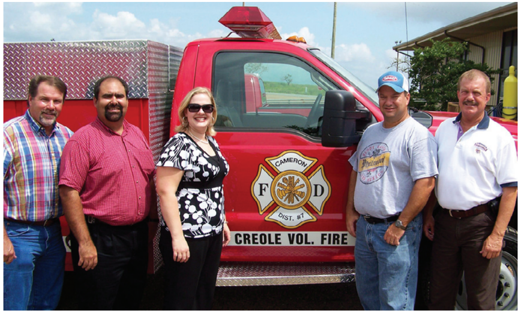
Creole fire truck