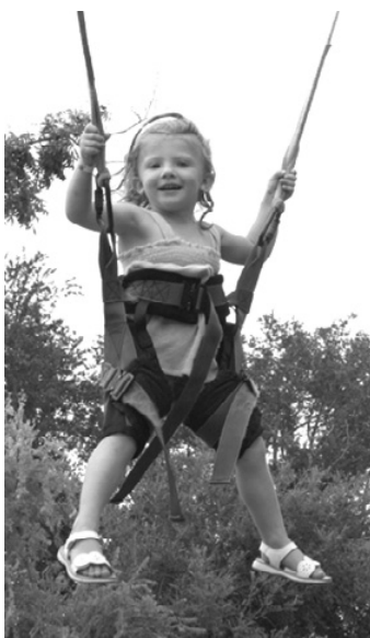
FLYING HIGH - a small festival goer wasn't afraid to fly on the bungee bounce ride at the Cameron Saltwater Fishing Festival.