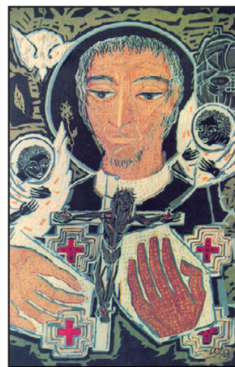
St. Peter Claver

Peter Claver, the son of a Catalonian farmer, was born at Verdu, in 1581; he died September 8, 1654. He obtained his first degrees at the University of Barcelona. At the age of 20, he entered the Jesuit novitiate at Tarragona. While he was studying philosophy at Majorca in 1605, Alphonsus Rodriguez, the saintly door-keeper of the college, learned from God the future mission of his young associate, and thenceforth never ceased exhorting him to set out to evangelize the Spanish possessions in America. Peter obeyed, and in 1610 landed at Cartagena, where for forty-four years he was the Apostle of the Negro slaves. By its position in the Caribbean Sea, Cartagena became the chief slave-mart of the New World.