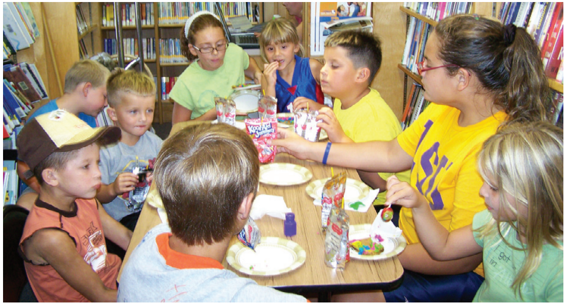
THE JOHNSON BAYOU Library held a party for the participants and friends of their Summer Reading Program. The children enjoyed refreshments, and were awarded certificates and prizes for participating and for the most books read by age division.