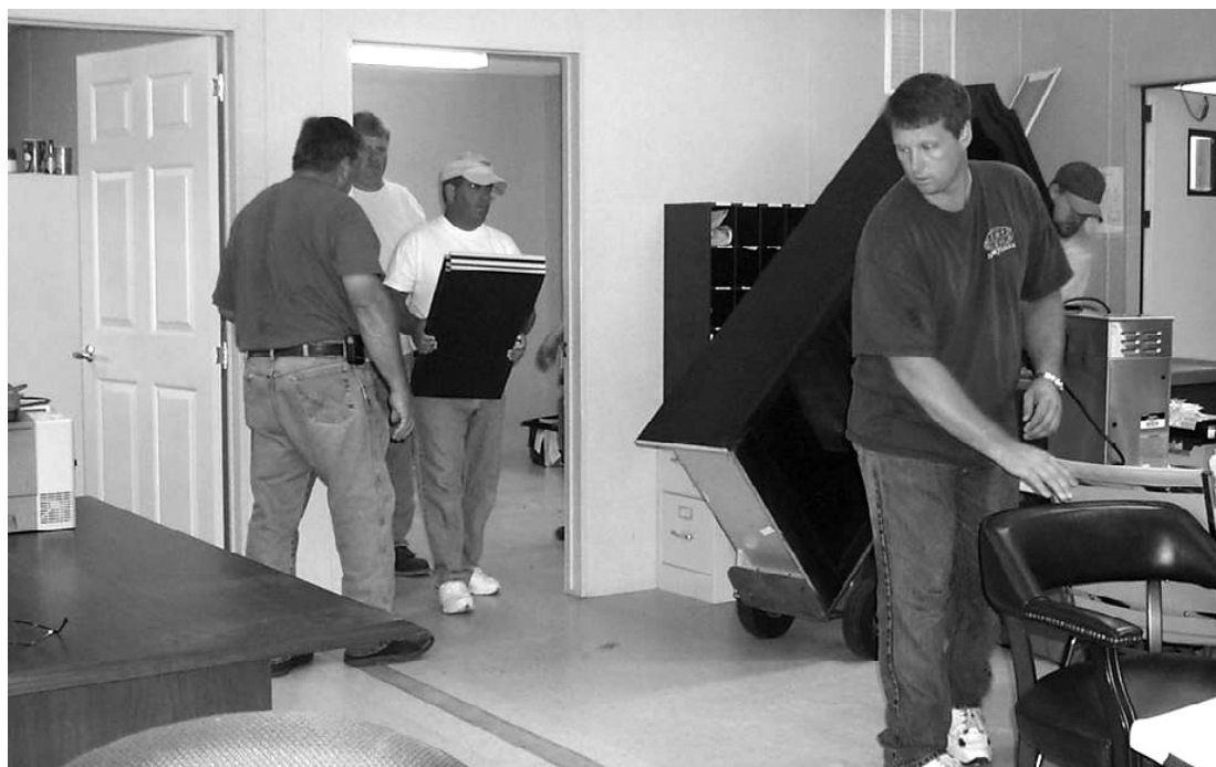
EMPLOYEES FROM Cheniere Energy, Enbridge and Williams assisted Johnson Bayou High School in July in moving the office and elementary wing from temporary buildings to the permanent building.

Go to http://www.simpleanddelicious.com/b2s_guide.jsp for recipe ideas.