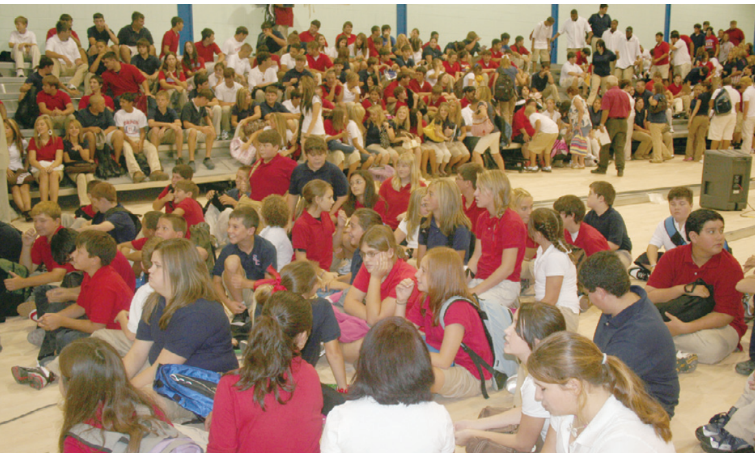
SOUTH CAMERON students returned to school on Thursday, August 16. Everyone was able to report to the gym.