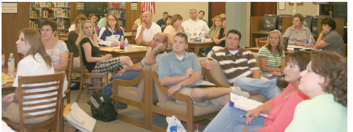
CAMERON PARISH new teacher in-service was held on August 6-8. Teachers were informed on policies, insurance and various teaching techniques.

fresh fruit cup, brown gravy, wheat biscuits, milk.