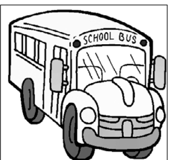
Remember to stop for school buses.

• Close drapes and blinds to keep out the sun's rays during the day, and open them at night to allow the heat to escape through the glass.