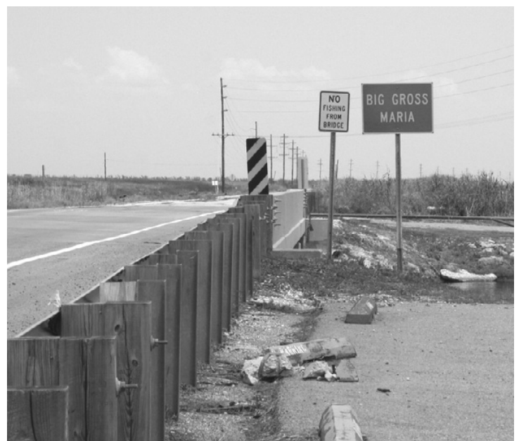
SOMEONE at DOTD either can't spell or has a weird sense of humor. Signs on Hwy 27 through the Sabine Refuge have changed the name of Big Cross Marais and Little Cross Marais to Big and Little Gross. These signs have been in place for over a year, and no one has apparently complained.

The two men were listed in stable condition.