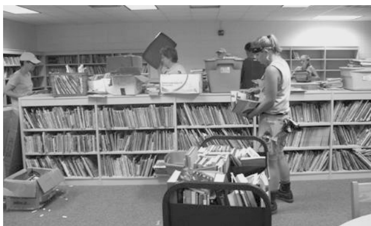
ON AUG. 2, AEGON USA with the assistance of AmeriCorps workers moved the middle and high school classes and stocked the library shelves.

The next meeting was set for August 21, 2007 at 4:30 p.m. There being no further busi-