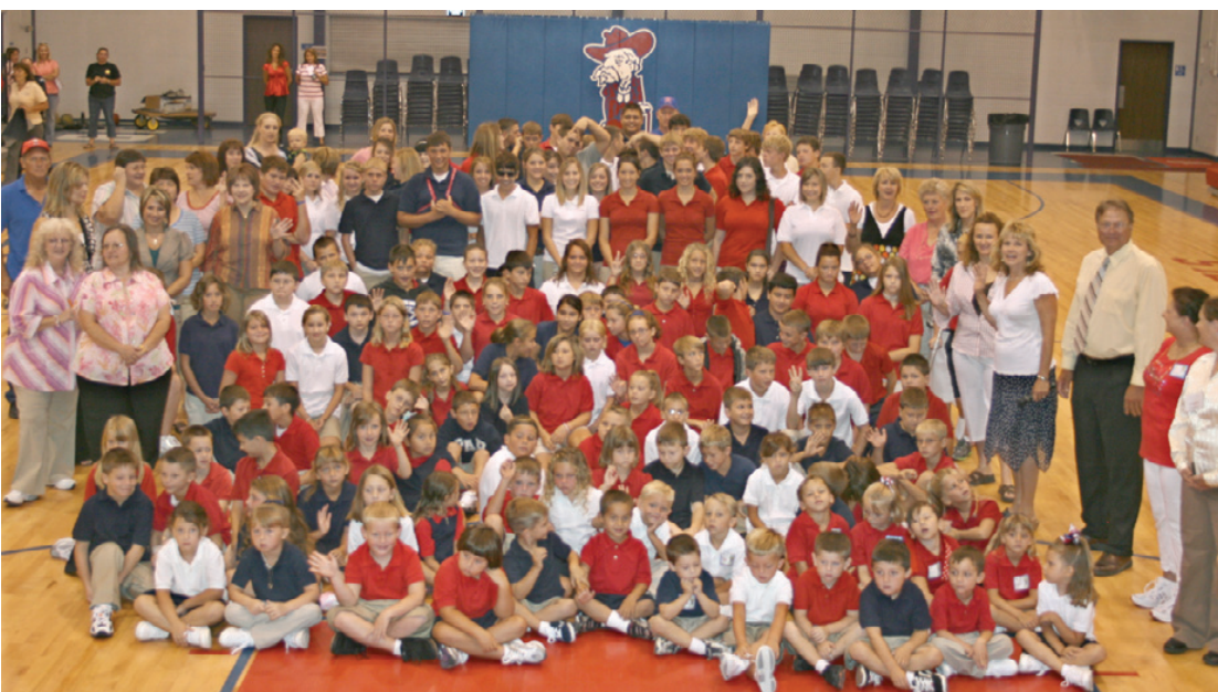
STUDENTS AND FACULTY at Johnson Bayou are shown assembled for the first day of school.