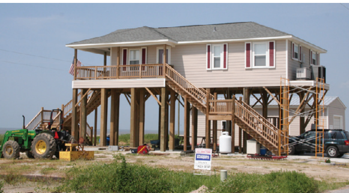
THIS NEW beach house at Holly Beach, right next to the Gulf, is being built at least 20 feet above sea level to hopefully survive any future hurricane storm surge.