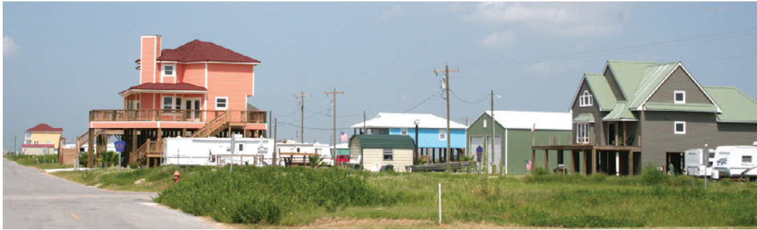
COLORFUL BEACH HOMES bloom at Holly Beach almost two years after Hurricane Rita wiped the community away.