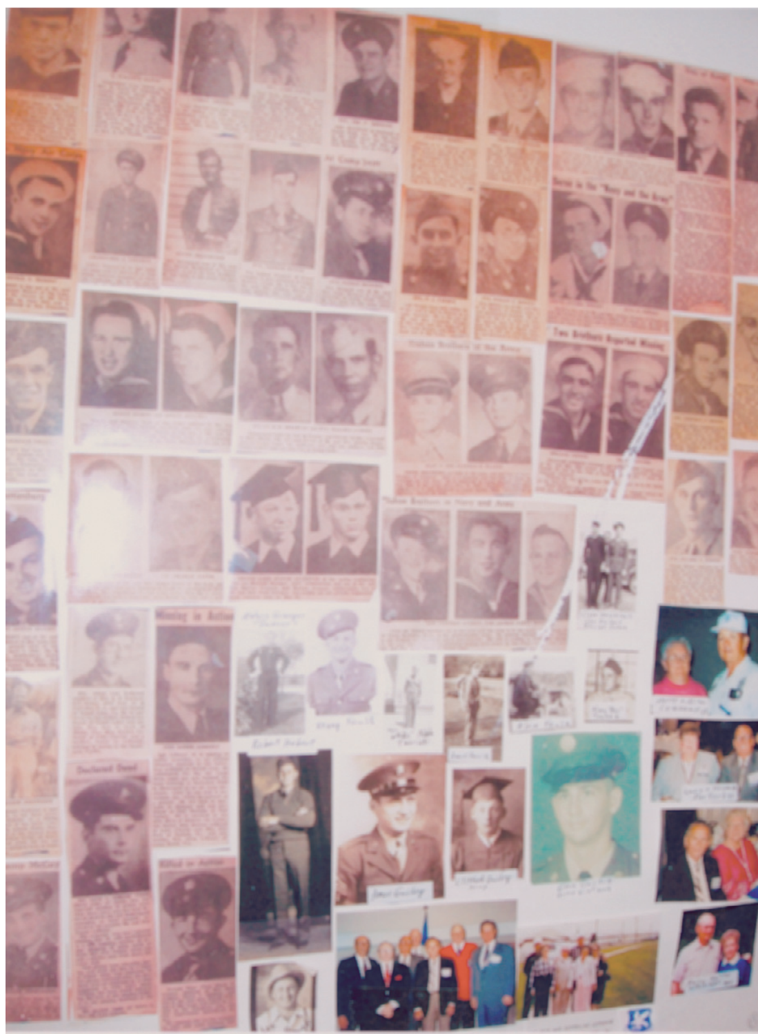
Cameron Parish Servicemen