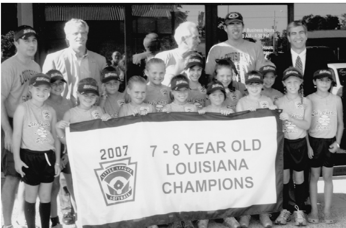
Lake Charles All Stars