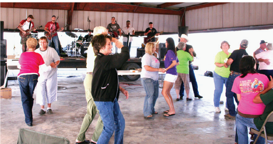
DANCING TO THE music of the Steel Shot Band at the Alligator Festival Sunday afternoon at Grand Chenier Park.