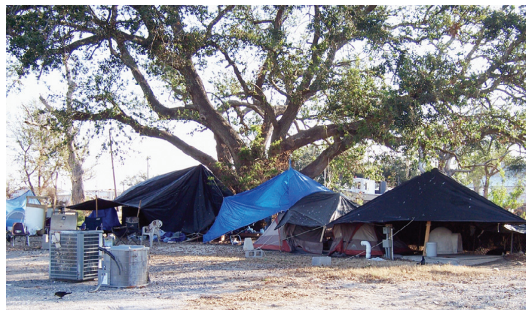
TENTS SET up in the former FEMA RV park in Cameron highlight the lack of temporary housing in lower Cameron Parish following Hurricane Ike. Colder temperatures of approaching winter make the situation more serious, yet no plan has been approved to provide temporary housing in lower Cameron Parish.