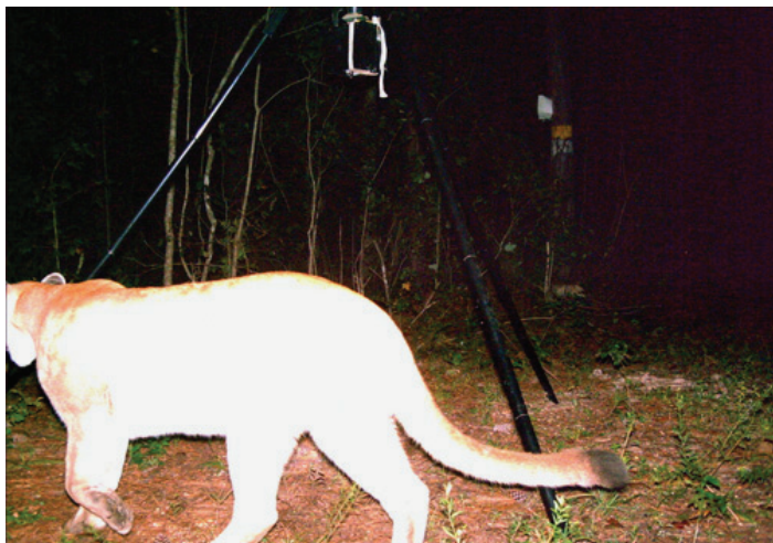
THIS COUGAR was sighted Sept. 29 in Allen Parish. The mountain lion, cougar, panther or puma are names that all refer to the same animal. Their color ranges from lighter tan to brownish grey. The only species of big cats that occur as black are the jaguar and leopard. Jaguars are native to South America and leopards are native to Africa.