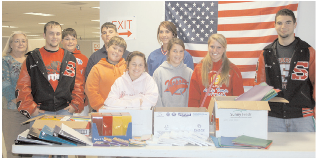
SOUTH CAMERON High School students are shown accepting the donation of school supplies given by the Starks High School student body, student council and FACS department. South Cameron also received a donation of school uniforms from the Moss Bluff United Methodist Church.