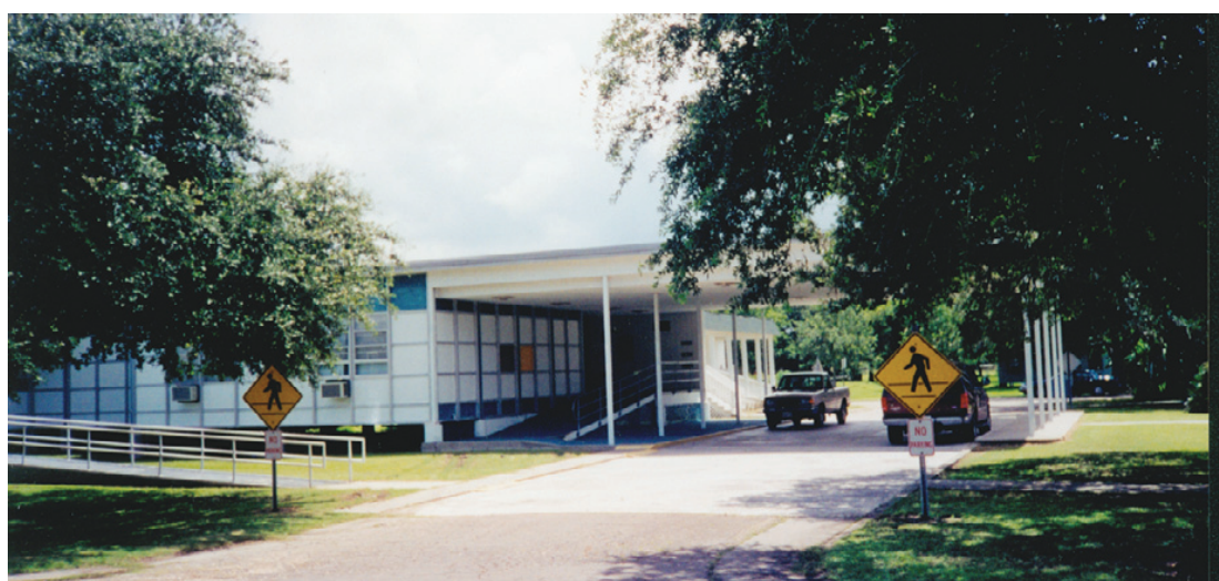
THIS IS A photo of the South Cameron Memorial Hospital prior to its destruction in September, 2005, by Hurricane Rita. Construction on a new hospital will begin in the near future.