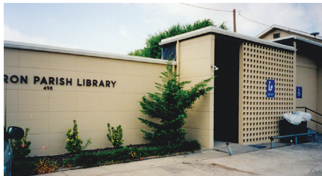
THE CAMERON PARISH Library, which was destroyed by Hurricane Rita in September, 2005, will be rebuilt in the near future with insurance funds and grants. The library was built following Hurricane Audrey in 1957.