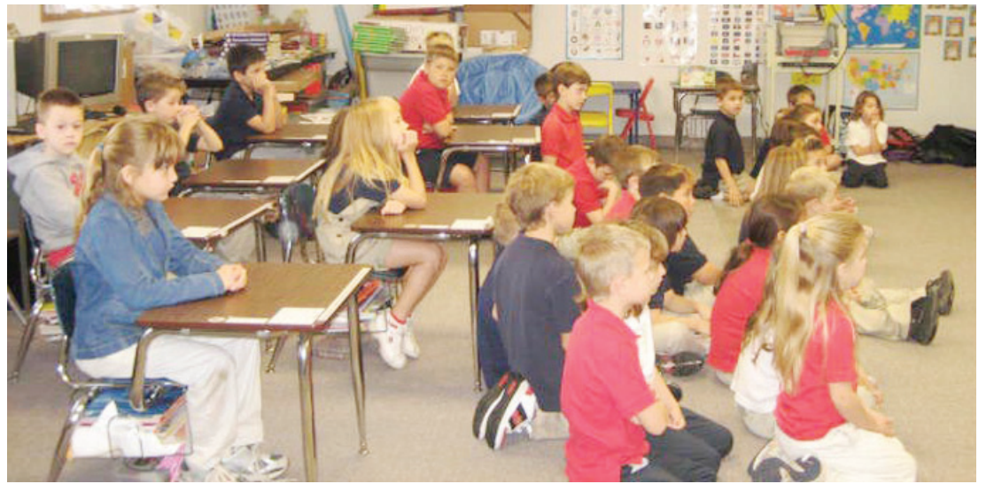
STORYTELLERS acted out stories as K-third graders at Johnson Bayou School watched attentively on Wednesday.