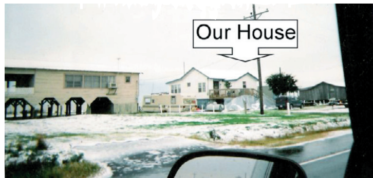
JEROME AND KATHY Richard were out of town during "The Holly Beach White Christmas Holidays," but this picture was taken by a friend a few days after the snowfall. The Richards still had snow when they returned four days later.

Reames advises placing microwave-safe plastic wrap loosely over food so that steam can escape, and don't let it directly touch your food. Some plastic wraps have