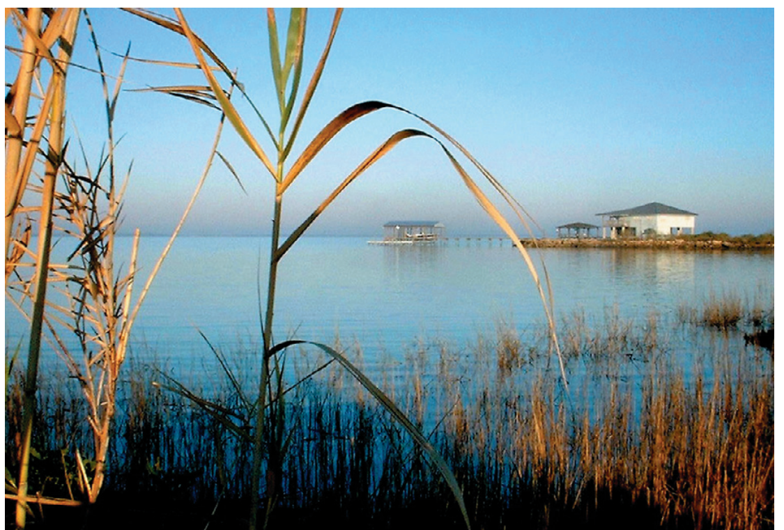
THIS BEAUTIFUL scene was photographed at Pelican's Point at Hebert's Marina on Big Lake. Many new summer homes are being built in this area.