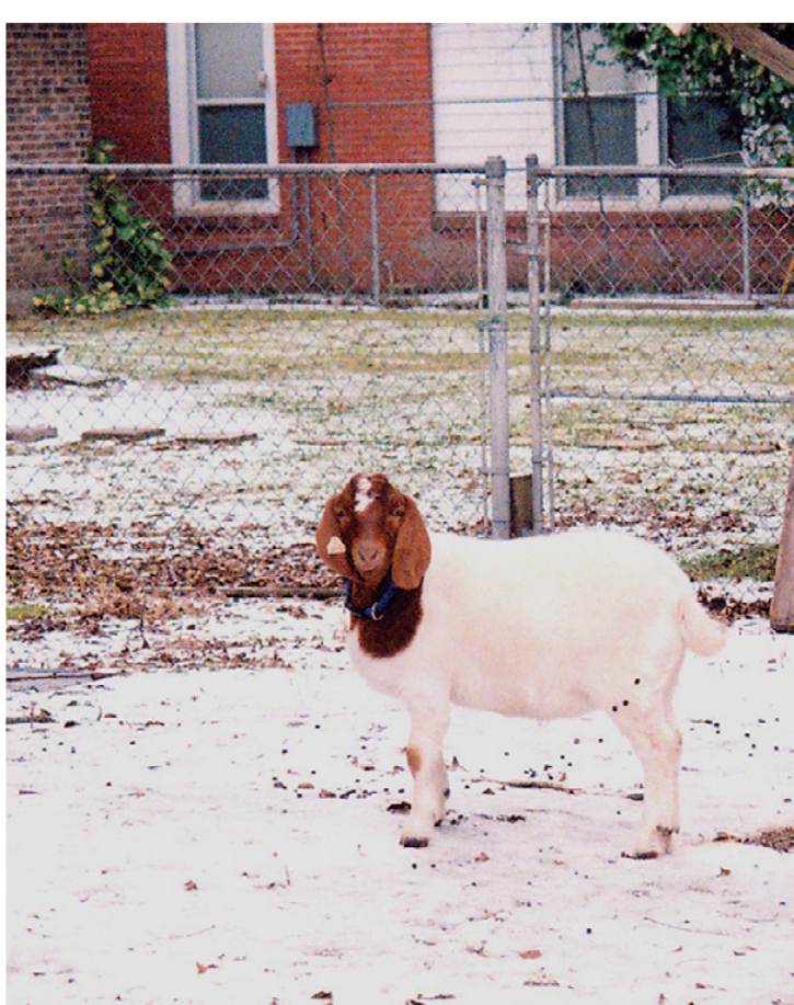
SABRINA PESHOFF and Ethan Nunez's goats loved the sleet and snow that fell on Christmas morning. The goats are for the 4-H projects which they will complete in January. The goats with their thick coats loved the cold and were playing lots of games together in the one inch of snow and sleet covering their pen.

Remember this! "Grandma used to set her hot baked apple pies on the window sill to cool. Her granddaughters set theirs on the window sill to thaw."