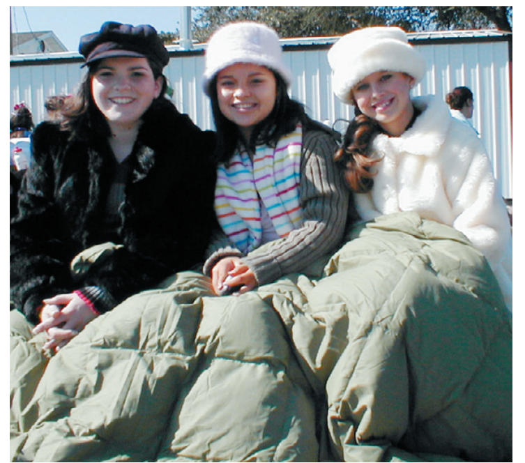
THE LOUISIANA Fur and Wildlife Festival has the reputation of being the "coldest festival in the state" since it is held in January every year. These three young ladies were dressed warmly when they rode on a float in last year's festival parade. This year's parade will be held Saturday, Jan. 8.